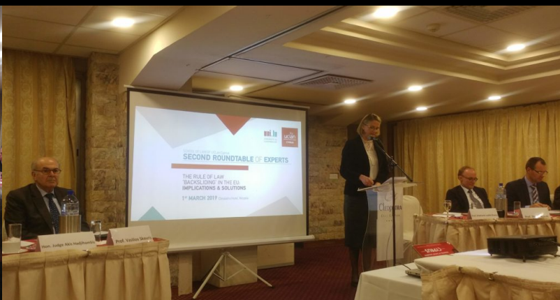
Second Roundtable of Experts 1 March 2019