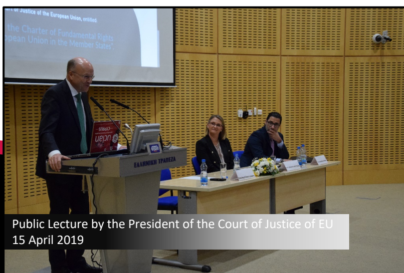
Public Lecture by the President of the Court of Justice of EU 15 April 2019

Venue | Hellenic Bank Amphitheatre, Nicosia