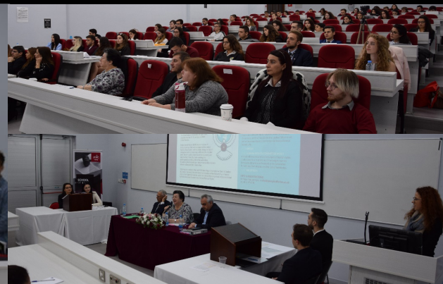
3 rd Annual Model United Nations 29 March 2019