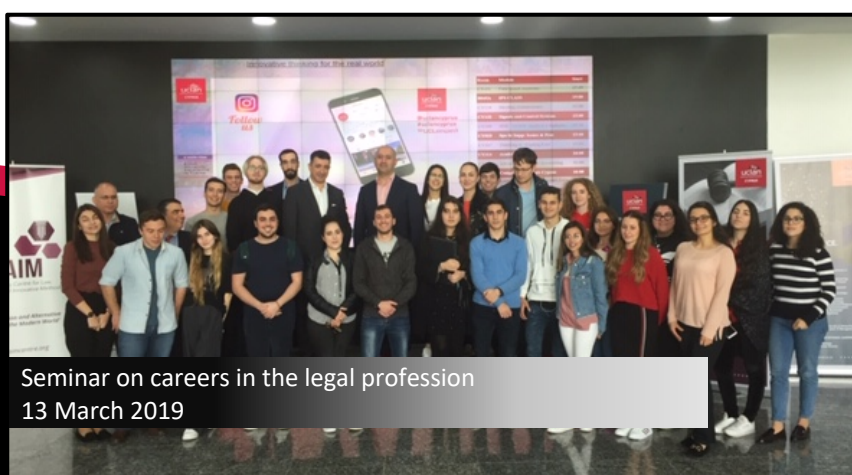
Seminar on careers in the legal profession 13 March 2019