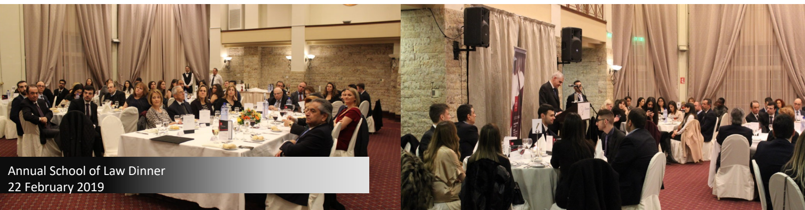
Annual School of Law Dinner 22 February 2019